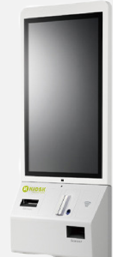
Paragon TK-3200 Series