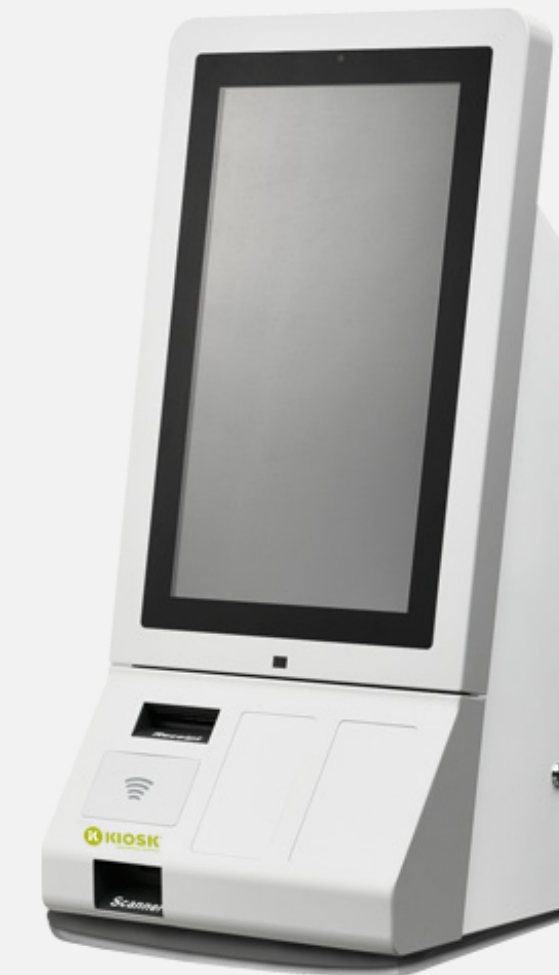
Stellar TK-2100 Series